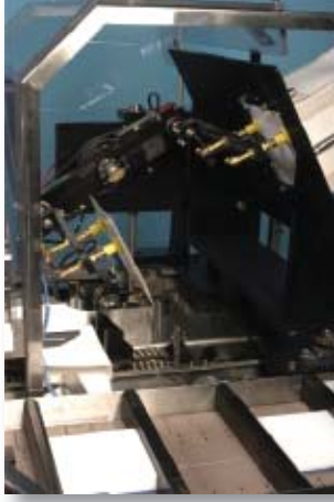
2 Head Rotary Carton Erector