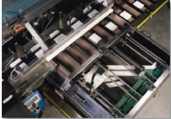
Optional Barrel Cam Product Loader