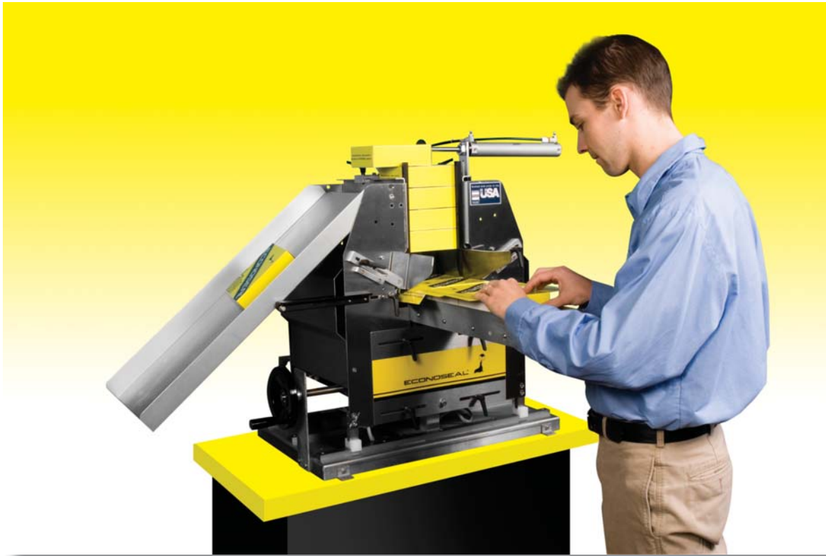
Twinseal shown with options of hand crank adjustment and delivery chute