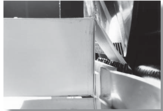
A row of fingers applies glue to the underside of the flap(s) to be sealed. This non-pressurized, open pot, glue finger system eliminates clogging.

Infeed conveyors are available to transport filled packages directly into the Twinseal without the need for an operator to feed loaded cartons directly into the Twinseal.